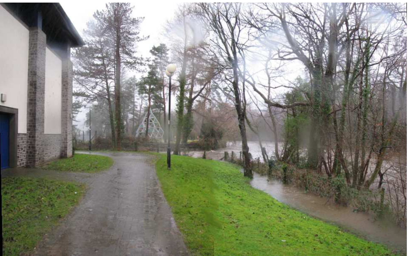
Figure 9: River encroachment at the Leisure Centre. This building is at risk of flooding from the river, and also through inland water routing from flooded land around the Fire Station.