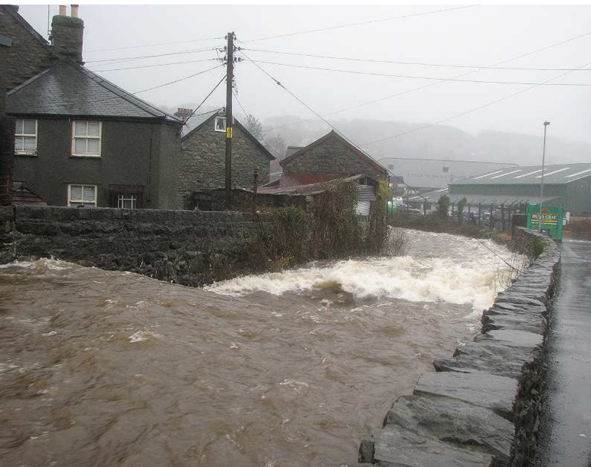
Figure 10: Arran Road bridge. Some flood risk exists because of the very low clearance below the bridge, which in turn is due to extensive gravel accumulation at this point. Downstream of the immediate bridge area, substantial high flood walls protect properties in the town.