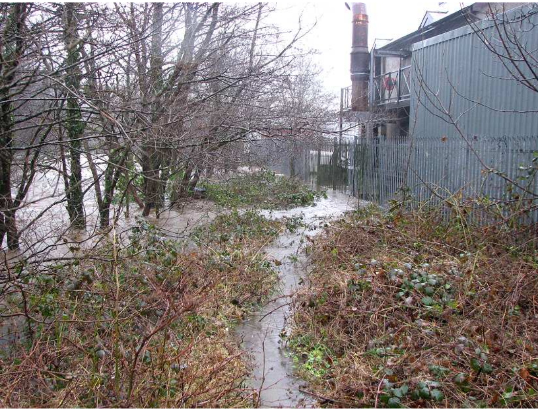
Figure 8: Flood waters overtopping the riverbanks upstream from the Fire Station