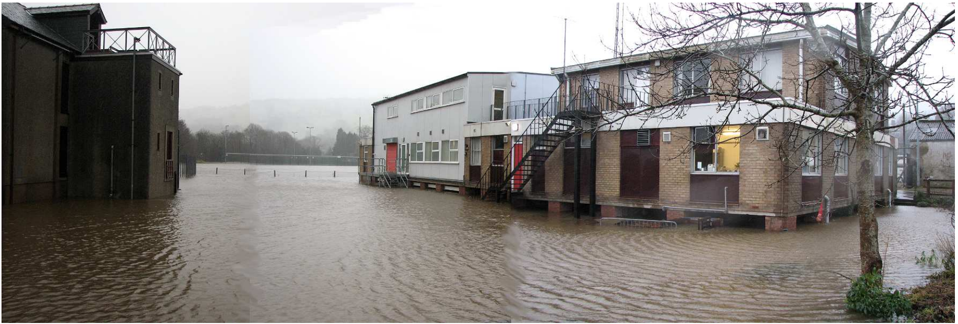
Figure 7: Extensive flooding around the Fire Station, Arran Road