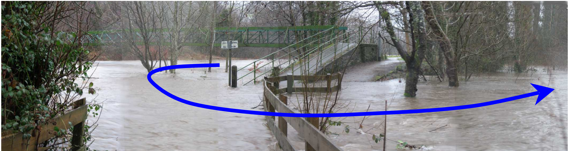
Figure 1: Confluence at Pandy'r Odyn.

Floodwater is seen to be entering the Marian Mawr fields from the western end. Flow volume is enormous.