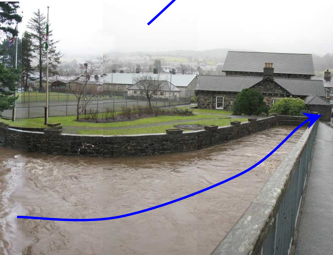
Figure 4: The route of highest risk for flooding of properties in Dolgellau is shown above. This involves water breaching the wall at the end of Bont Fawr and flowing down hill past the Court Building into Bridge Street. Indeed, as these pictures were being taken, a Council lorry loaded with sand bags arrived to reinforce this section of wall.