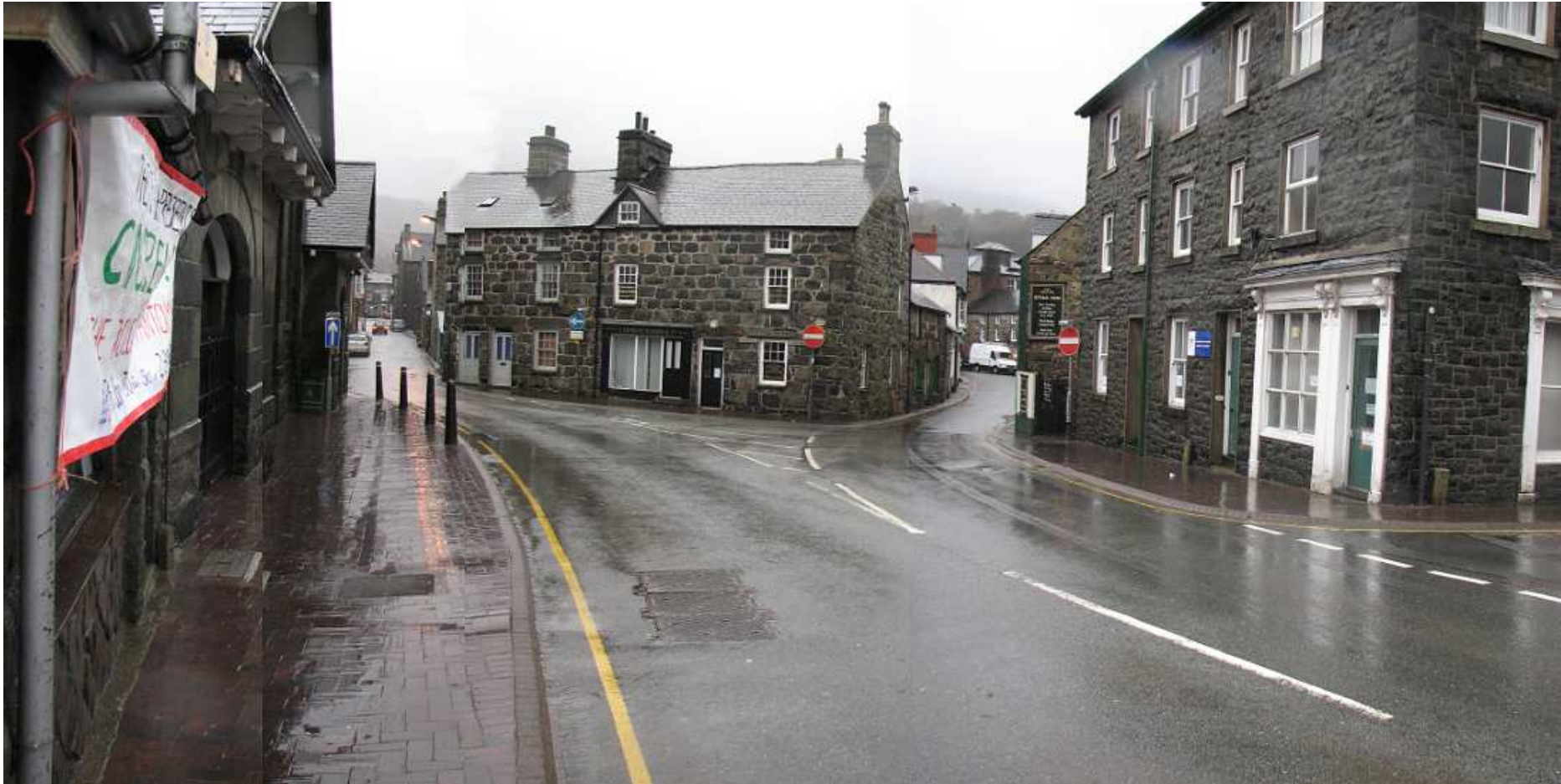
Figure 3: Streets leading into Dolgellau from Bont Fawr.

It is noticeable from the orientation of building features that Ffos y Felin (to the left) slopes upwards from this point, whilst Bridge Street (to the right) initially slopes downwards following a presumed former course of the Arran stream.