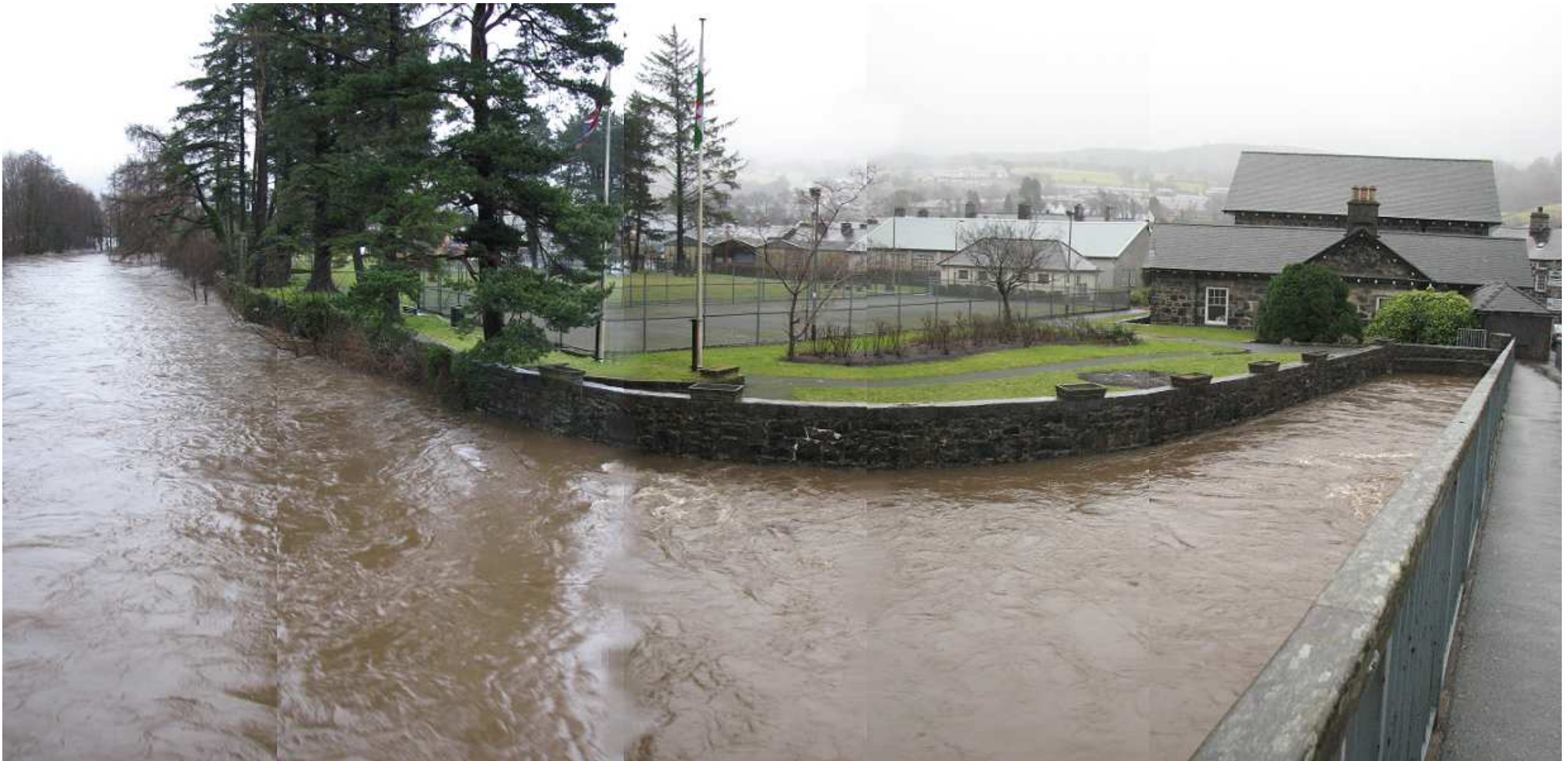
Figure 2: Afon Wnion upstream from Bont Fawr.

The high river walls are very adequately protecting the park from flooding.