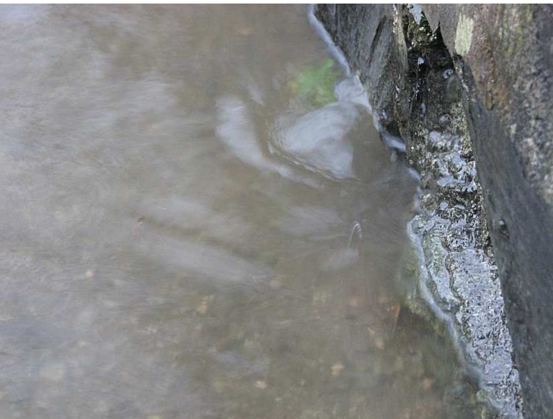
Figure 6: Leakage of flood water through the river wall at the Marian car park